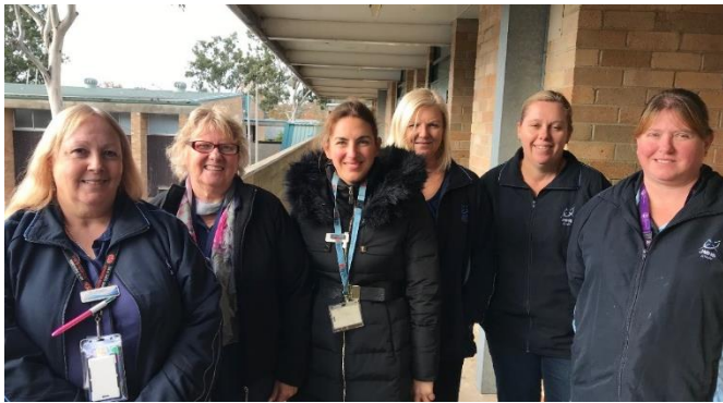
Our Support Unit SLSO's who work with our students in specialist classes for students with disabilities