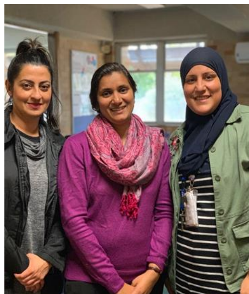
We have a dedicated team of SLSO's who work across our regular classes to support a wide range of students' needs

Our Learning and Support Team meets fortnightly to discuss the needs of students who may be experiencing difficulty with their learning. A key feature of our Learning and Support Team is the facilitation of collaborative planning between teachers, support staff, parents and students. Please feel free to contact the team at school to discuss any concerns or questions you may have about how to access additional support.